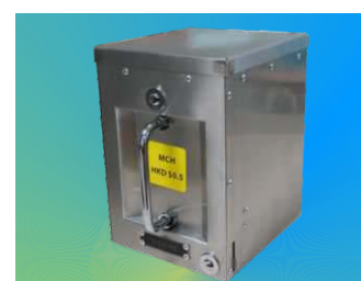
Hopper with double locks